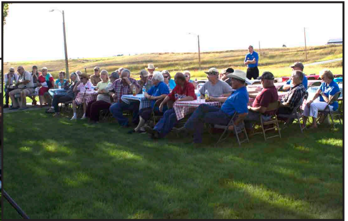
Community meetings clockwise from top left: West Kootenai, Eureka, Trego, Olney