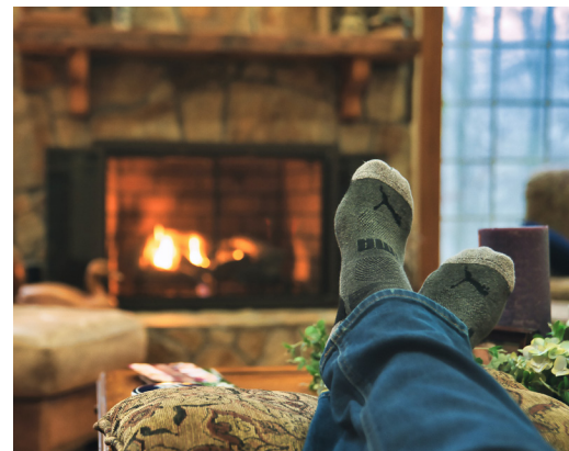
There's nothing better than a warm fire on a chilly night, but it's important to maintain your fireplace for safety.