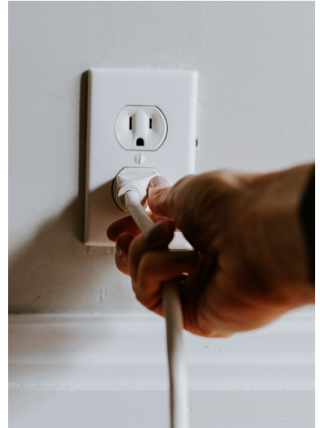
Avoid overloading electrical outlets and power strips. When overloaded with electrical items, outlets and power strips can overheat and catch fire.