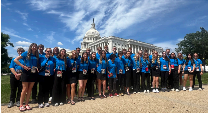
The 2024 Montana Youth Tour delegation