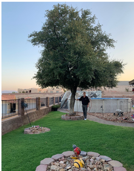
ABOVE: Plant trees that provide shade during the heat of the summer. | PHOTO CREDIT: MOHAVE ELECTRIC COOPERATIVE BELOW: Strategically placed trees shade your home during the summertime, which can lower your energy bills. | PHOTO CREDIT: PEXELS